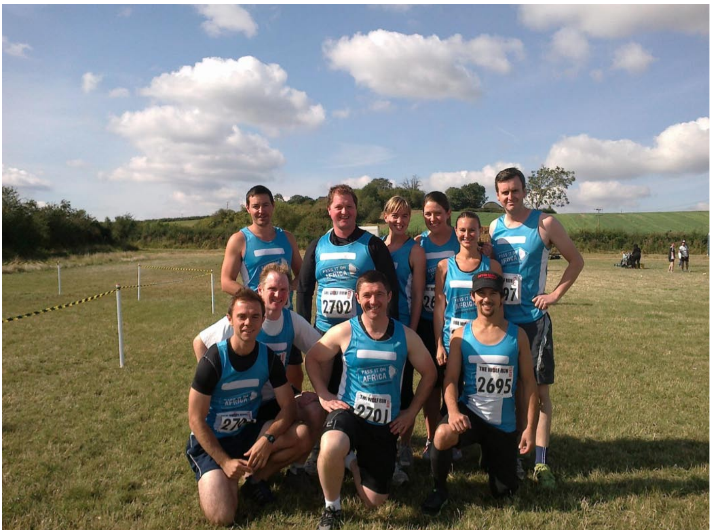
The Pass It On Africa Wolf pack!

A ten strong team took part in this endurance event and raised £2,031 . Thank you all! The team behind the two races also helped us hugely with our own HEROES RUN organisation.