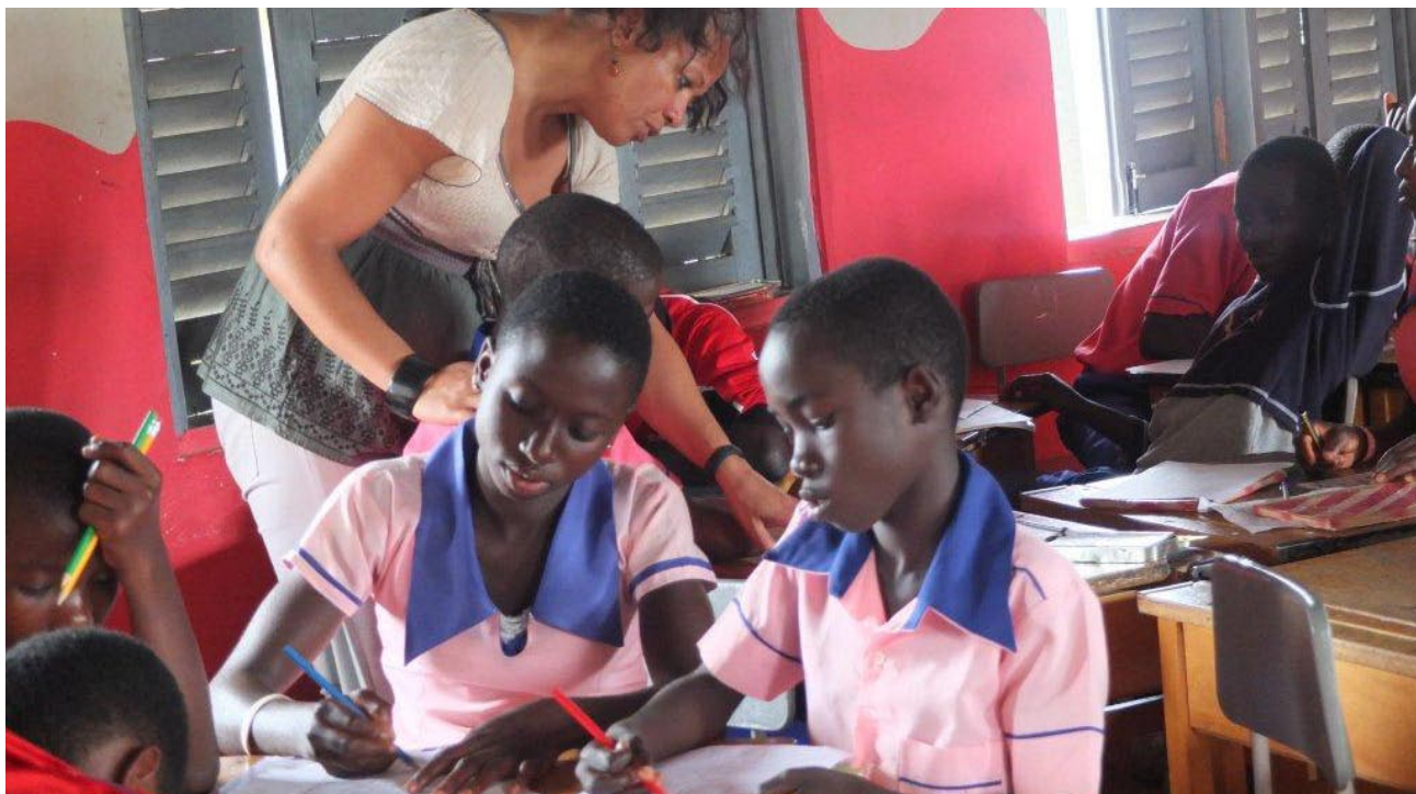
September 2012: The children of the Dreamlands school, Ghana right where they belong - in the classroom

Nearly eight years on, buying shoes has evolved into supporting passionate teachers in Kenya, Ghana and The Gambia, helping them to build schools and improve education for their communities. We are incredibly grateful to those who supported our events, including black tie dinners, art auctions, breezeblock carrying competitions, the Batman vs. Robin rugby match, sponsored cycle rides and thirteen HEROES RUNs. Numerous businesses, schools, and private individuals have given their time and money too. Your incredible generosity means that since we started we have raised close to £370,000 , and 60% of that has been given out as grants to support education in Africa – or is still available in our cash reserve.