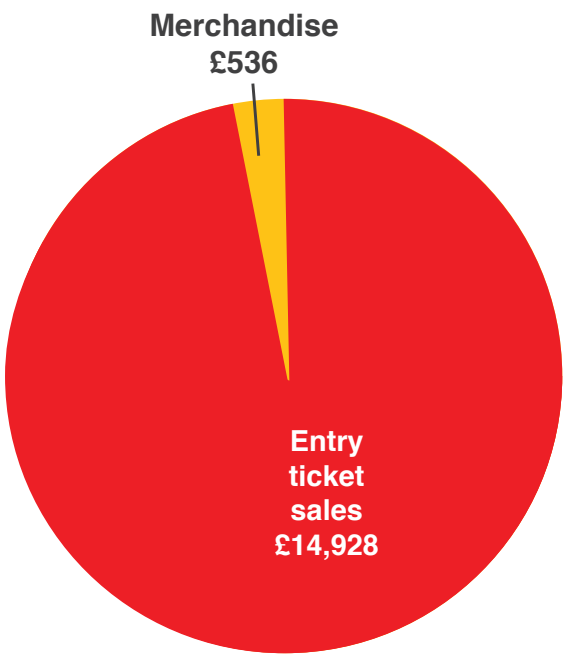
HEROES RUN v VILLAINS RUN 2015 income